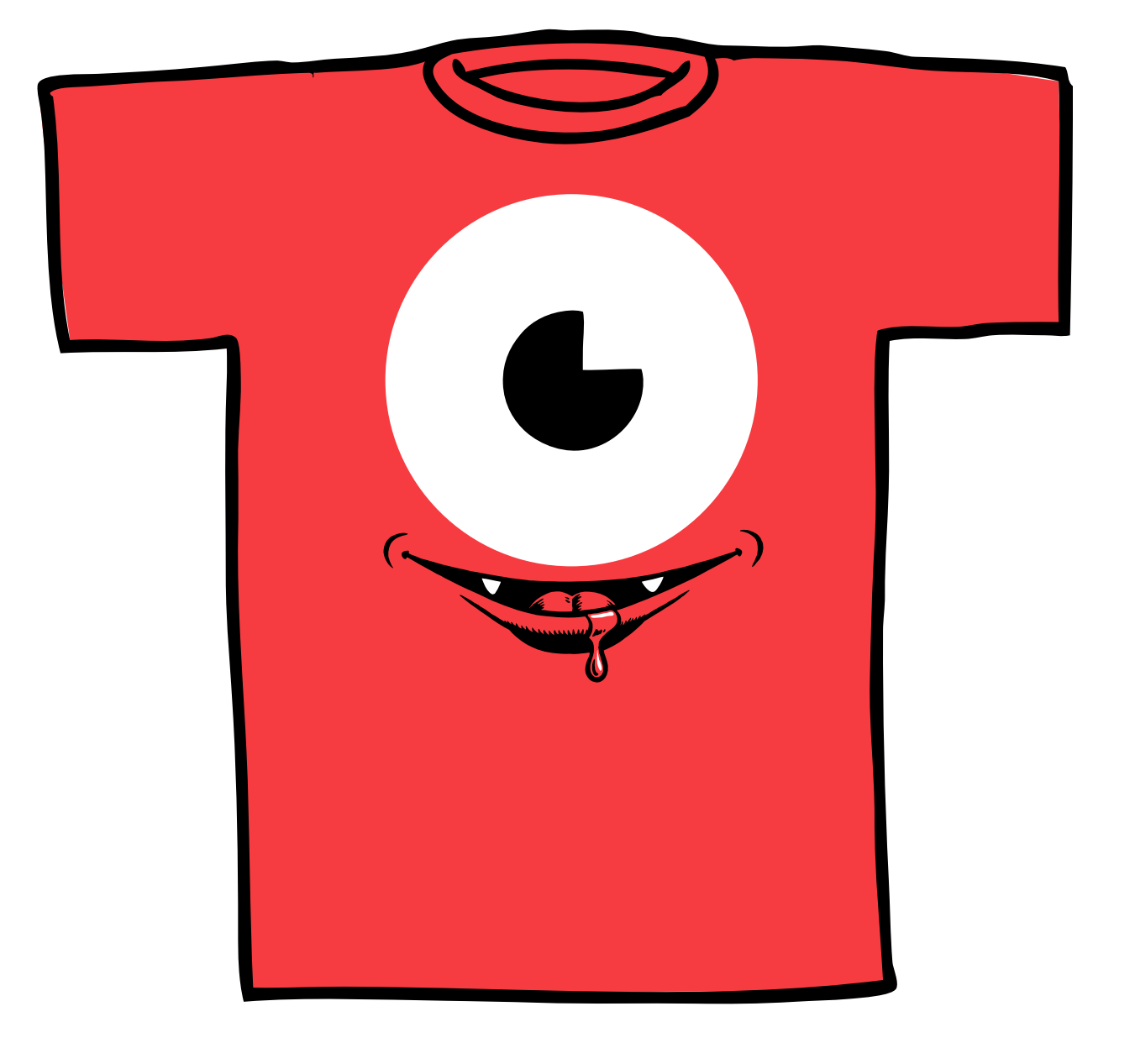
HAPPY EYE SHIRT XS, S, M, I